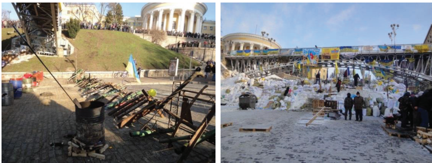
Transformation of Lvivska Brama barricades: December 22, 2013 and January 24, 2014 (all pictures are by the author).

A special context of the Maidan was created by barricades that experienced a quick evolution: from small symbolic barriers that looked more like art installations, rather than defense structures, to strong fortifications made of ice, snow, tires, and bags with garbage.