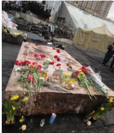
The sculpture after installation on January 8, 2014, after the shooting of the heroes on February 21, 2014, and mourning on February 25, 2014.

From the first revolutionary days, cinema began to record the events of the Maidan. There a civil initiative involving filmmakers called BABYLON'13 was created. They shot few-minute mini-documentaries. Their main goal was to motivate the viewer to work hard for the sake of the future, rather than to create chronicles.