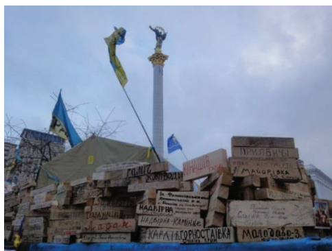
“Geographical” installation at the Maidan – January 8, 2014.

On the corner of Instytutska and Khreschatyk streets near Lvivska Brama barricade, protestors began to put together wooden plates with names of different cities and villages, as well as districts of Kyiv. As a result, there appeared a creative construction symbolizing the unity of Ukraine. It grew every day. We called it “geographic installation.” There were a few plates with names of foreign cities, but mostly it was an exciting trip all over Ukraine. When the frosts started, some plates went to bonfires for warming, and during the bloody days of February 18–20, 2014, it was practically ruined by conflagration.